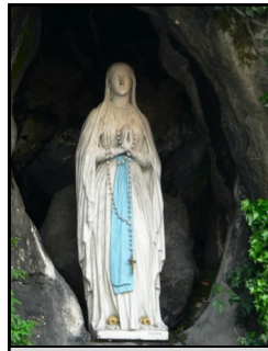
Our Lady of Lourdes, pray for us.

The essence of Christian morality is a relationship with God and his will, not just human self-fulfillment or society or abstract ideals or values, however important these aspects of morality are. The quest for personal happiness, for social justice and peace, and for higher and deeper human values is still quite popular in modern secular civilization, fortunately. But the idea of submission to God's authority and obedience to his laws certainly is not. Just think of what immediate reaction is produced by the words "submission", "authority", "obedience", and "laws". (Adapted from Peter Kreeft's, Catholic Christianity )