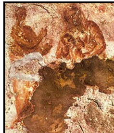
Earliest fresco of the Virgin Mary, Catacomb of Priscilla, 2nd century

The Catechism of the Catholic Church describes the Trinity as the "central" mystery of faith. It states, "The mystery of the Most Holy Trinity is the central mystery of Christian faith and life. It is the mystery of God in himself. It is therefore the source of all the other mysteries of faith, the light that enlightens them. It is the most fundamental and essential teaching in the 'hierarchy of the truths of faith' [GCD 43]. The whole history of salvation is identical with the history of the way and the means by which the one true God, Father, Son and Holy Spirit, reveals himself to men 'and reconciles and unites with himself those who turn away from sin' [GCD 47]" (CCC 234).